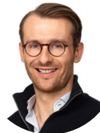
Charles Horn Ventures Analyst

Katie brings a robust background in asset and wealth management; experienced at aligning investor goals with tailored investment products. She has previously utilised her analytical prowess to devise and launch main market investment products with an ESG focus. Katie is a Level 3 CFA candidate.